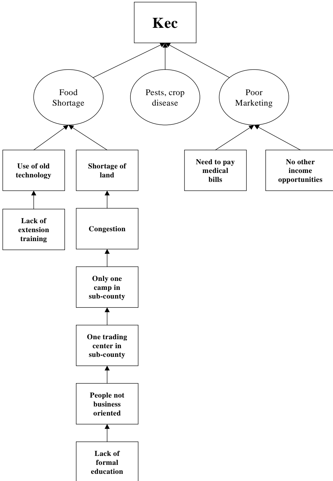
Figure 16. Example of Problem Tree with the problem identified as Kec (hunger) (by Settlement Action Teams in an IDP camp in Gulu, Uganda)